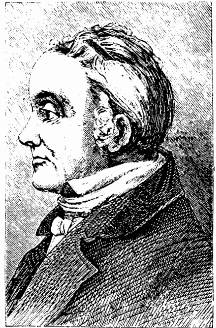
THADDEUS KOSCIUSZKO: 1817.